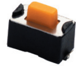
Gull Wing, 320g, Orange Actuator