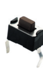
Thru-Hole, 160g, Brown Actuator

Used in applications such as consumer electronics, audio equipment, PCs, VCRs, cable boxes, modems, communications equipment, controls, security and alarm equipment, and test and measurement equipment.