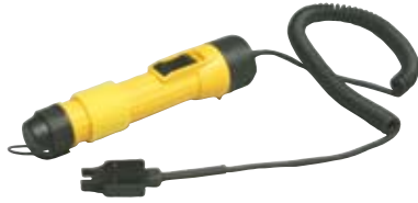
TracerLight Power Source FTL-PS