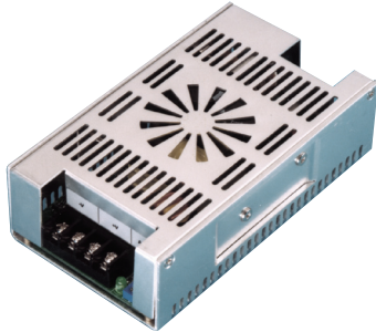
3.5"W x 6"L x 1.75"H