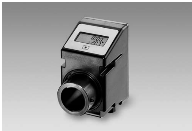
N 141 with cable output