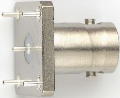
Model 7073 BNC (F) Straight PCB Mount 50 Ω