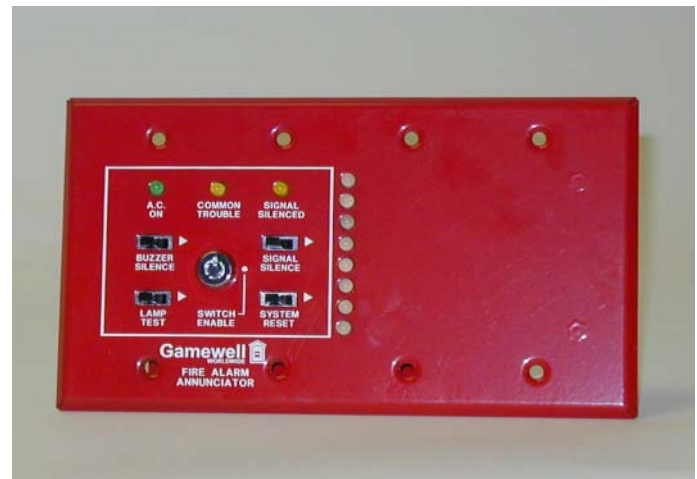
RA8 Remote Annunciator