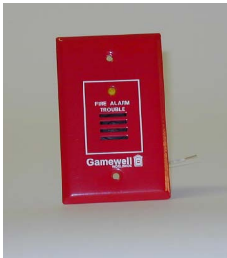
Remote Trouble Indicator