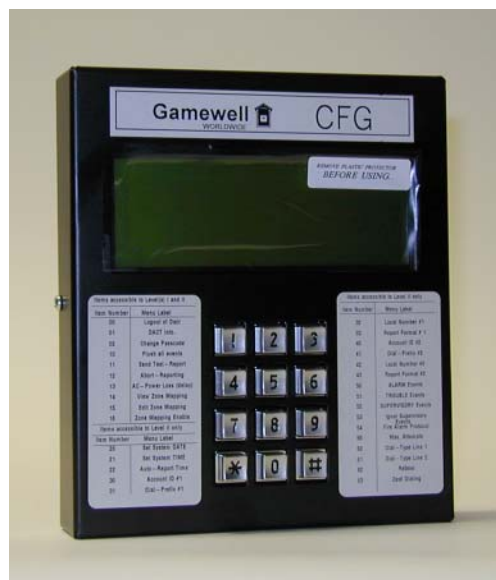
Configuration and Programming Tool CFG